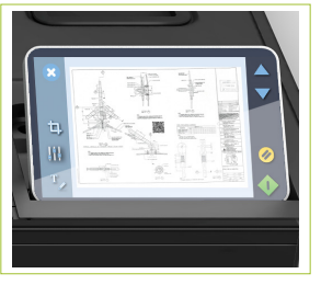
Control the entire scan process from the IQ FLEX built-in touchscreen computer

Operate from the touch panel or install the Nextimage software and run it from a PC or simply use rainforest365. Scan to any PC via Ethernet or Wi-Fi with the revolutionary Contex LINK pc utility.